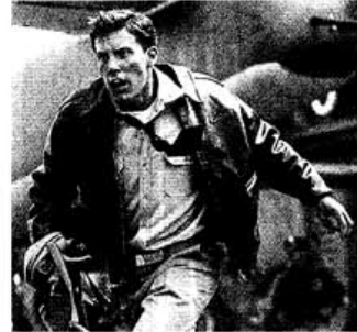
Affleck fights for love and country