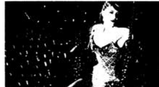
Kidman swings as the sultry courtesan Satine

De planes! De planes! Two best-buddy pilots (Ben Affleck and Josh Hartnett) fall for the same nurse (Kate Beckinsale)—and contend with a totally inconvenient Japanese sneak attack. When Affleck read the script, he says, "I thought it could be one of the seminal movies of my life where I could look back and go, 'I did this really huge, epic, classic movie that was about something substantive.'" Director Michael Bay ("Armageddon" and "The Rock") is attempting to make a "Saving Private Ryan"—or at least a "Titanic." "Pearl Harbor" is the most expensive movie budget Disney's ever authorized, and promises to be one of the most lavish, memorable movies of the season. MAY 25